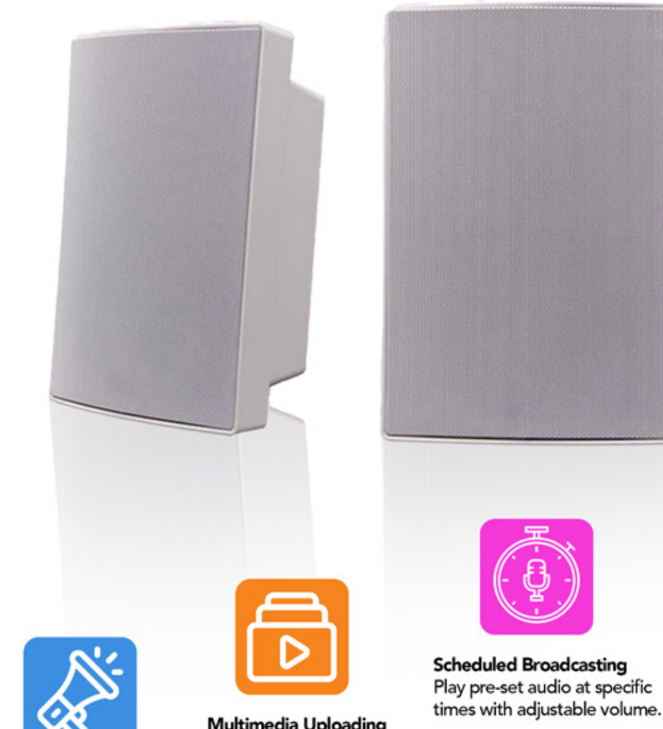
Multimedia Uploading Pre-set alarms, school bells and uploading options for personalised sounds. With support for multiple